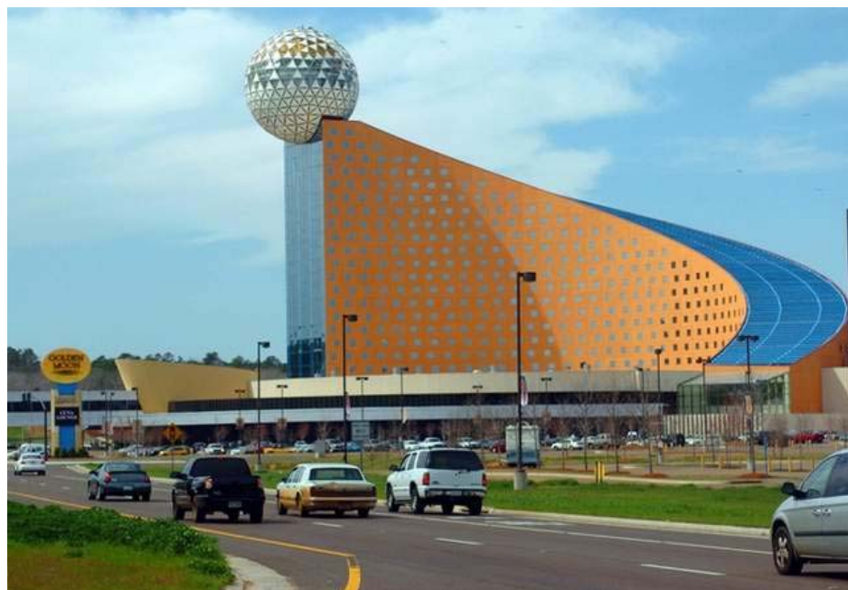
The Golden Moon Hotel and Casino